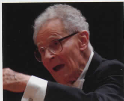
Stanislaw Skrowaczewski, conductor

Stanislaw Skrowaczewski commands an extraordinary level of respect in the international music community as both conductor and composer. He has been on the Minnesota Orchestra's artistic staff for nearly half its 112-year history, first as music director from 1960 to 1979 and subsequently as conductor laureate. He last led the ensemble in concerts with pianist Garrick Ohlsson in May 2015.